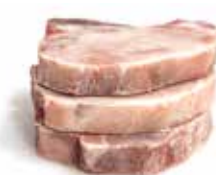
Pork loin in constant thickness portions