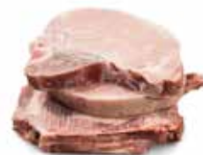
Pork loin in constant weight portions